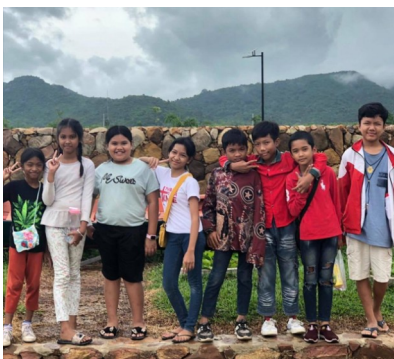
Young People in Kep

Last month a trip was organized to go to Kep a seaside province about 4 hours away from the city. Some young people from the church were going and one of the community English students also went. This was an amazing answer to prayer. This young boy spent a few days having fun and fellowship with the other young people and