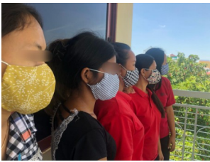
New Face masks