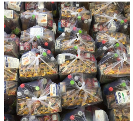
Food packages ready to go

We pray that over the next few years all of the provinces in Cambodia will be impacted by this. Please pray for the training that still needs to take place and the difficulties of this because of the restrictions with Covid-19.