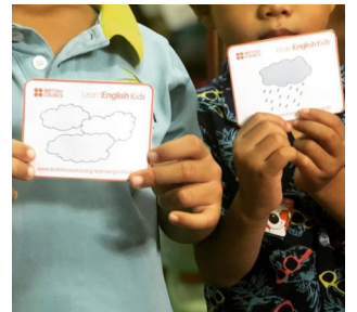
Children learning about the weather

find homework and resources to aid the children's learning. It is encouraging to see her enthusiasm and how she cares so much about the children's learning.