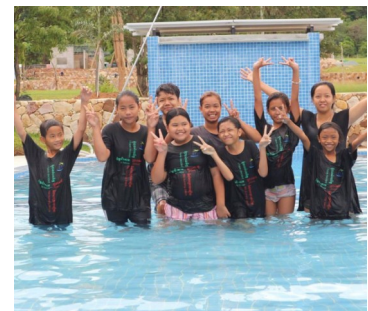
Young people getting baptised

learnt more about God. 7 young people decided to get baptized during this trip. It was such a special time for everyone involved.