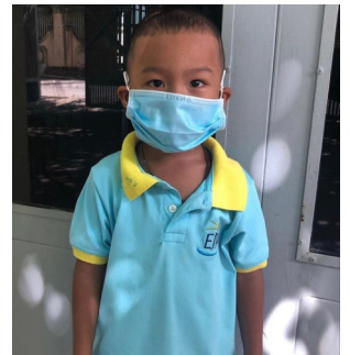
One of the children starting back at the ELC

about more cases of Covid-19 in the country. They are worried and do not want the ELC to have to close again.