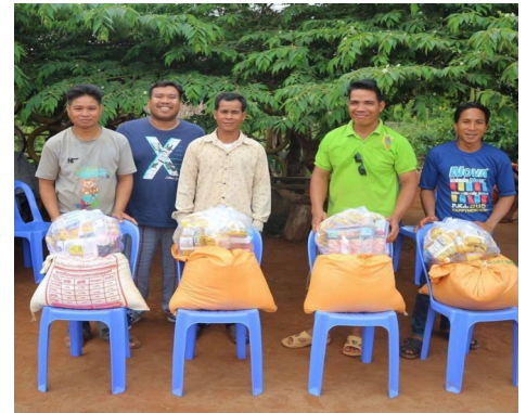
Some of the families receiving food packages

vide food packages for 37 families in 8 different provinces. The families were each so grateful. One of the families that received the food package was a Pastor who had given away his last portion of rice to a member of his congregation. He prayed to God to provide for his families need and that is when a few days later he received this food package. We praise God for the way He is meeting people's needs and for the support that has been provided for the people of Cambodia.