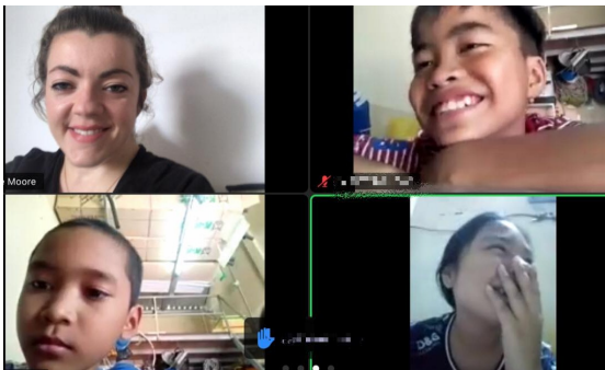
Learning English Online

This past month we have been able to organize and start Zoom lessons online for our community English students. It has been wonderful to see them again and to study together. The students are really keen to learn and each of them have said they are missing school. We see these young people in the community most days so we can still build on our relationship with