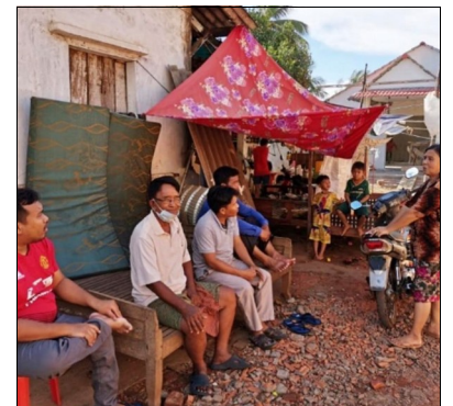
Some of the church planting team at the provinces

they met through the vision casting seminars that took place in Phnom Penh. God is doing wonderful things. There are great stories of God saving families who live in minority areas, pastors who have set up churches for ex prisoners and for their families, and one family who were provided with the finances they needed to get a bigger building to house all of the people who wanted to attend church. Please keep all these people in your prayers.