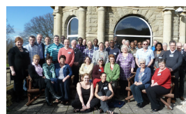
2015 CHAPLAINCY CONFERENCE ROUND-UP